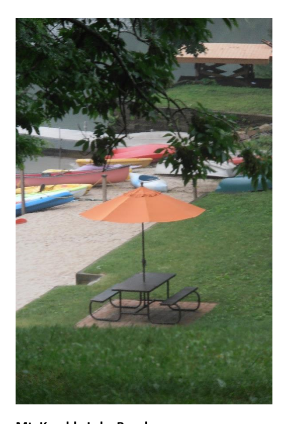
Mt. Kemble Lake Beach

Established in 1926, Mt. Kemble Lake is an unusual mix of privately owned homes and community owned assets, with a deep sense of volunteerism and community pride.