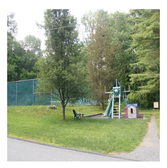
MKL Playground and Tennis Court