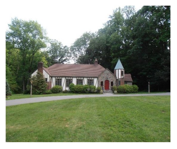
Mt. Kemble Lake Community Clubhouse

MKLtreasurer@gmail.com for details. The Treasurer's contact information may also be available from the current homeowners.