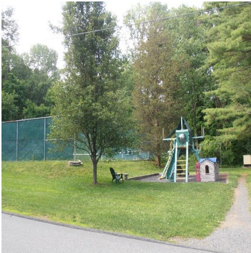
MKL Playground and Tennis Court