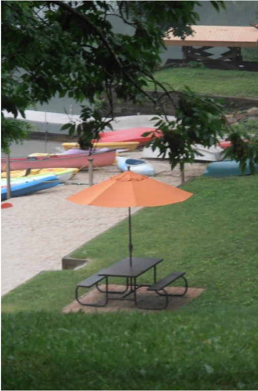
Mt. Kemble Lake Beach

Established in 1926, Mt. Kemble Lake is an unusual mix of privately owned homes and community owned assets, with a deep sense of volunteerism and community pride.