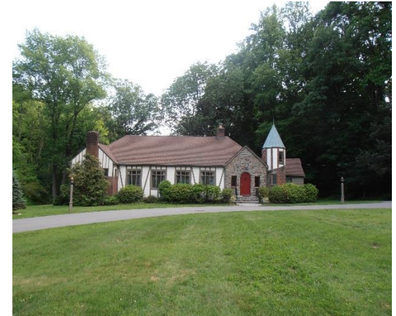
Mt. Kemble Lake Community Clubhouse

The community is responsible for all of the cost of maintaining our lake, clubhouse, roads, preserved property, and water company. Our annual dues are paid on a quarterly basis. When you purchase your home, you may be required to pay a prorated share of the dues, as well as a New Member Fee which is the equivalent of one year's dues. As of June 2015, the amount is $3,100. Please contact MKLtreasurer@gmail.com for details. The Treasurer's contact information may also be available from the current homeowners.