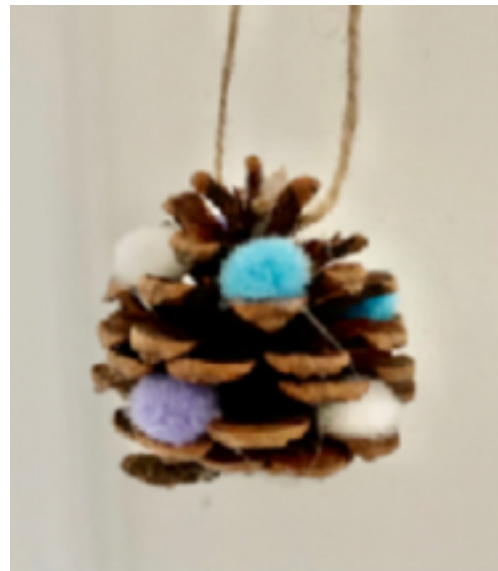
Pine cone ornaments $1.00