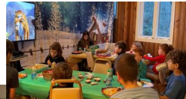
Kids Kartoon Korner