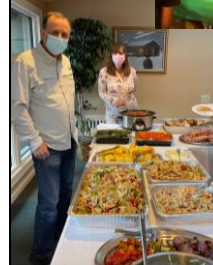
Fenchels & Groaning Board