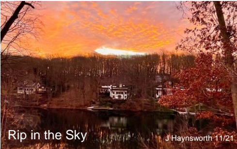
Rip in the Sky