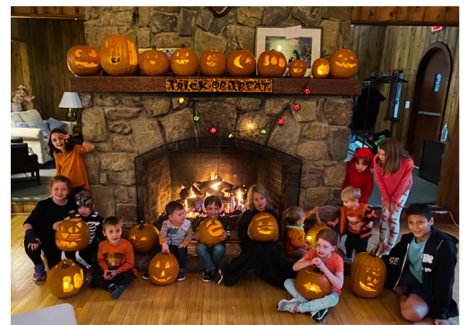
Lake Kids enjoying our Annual Pumpkin Carving Event on 10/29