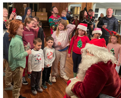
NVFD Santa Photo, at his annual visit to the Clubhouse!